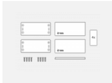
121-20101, S 2xend cap - plastic