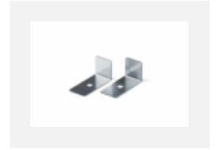
00-01200, F Accessory for gear-tray release