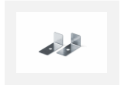
00-01200, F Accessory for gear-tray release