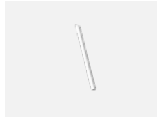
00-00352, W cable 3x0,75 2000mm, white