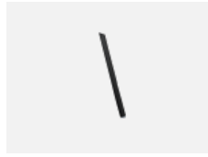
00-00352, B cable 3x0,75 2000mm, black