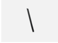
00-00358, B cable 3x0,75 4000mm, black