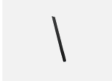
00-00360, B cable 3x0,75 6000mm, black