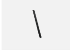
00-00356, B cable 5x0,75 4000mm, black