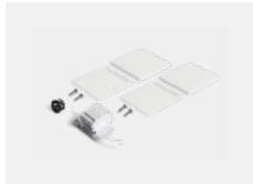
00-20101, W 2xend cap - metal, 5- conductor terminal box, grommet; Lipo80/Lina80