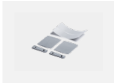
00-00200, N straight connector