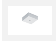
00-00370, W ceiling cup 80x80x32mm