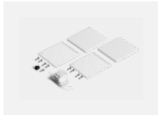
00-20103, W 2xend cap - plastic, 5- conductor terminal box, grommet; Lipo80/Lina80