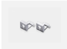
00-20700, W 2 pcs of wall fastening Lipo/Lina