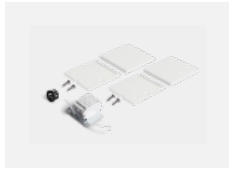
00-20101, W 2xend cap - metal, 5- conductor terminal box, grommet; Lipo80/Lina80