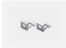
00-20700, W 2 pcs of wall fastening Lipo/Lina