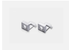
00-20700, B 2 pcs of wall fastening Lipo/Lina