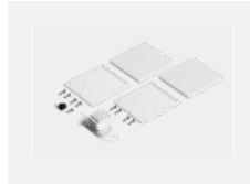
00-20103, W 2xend cap - plastic, 5- conductor terminal box, grommet; Lipo80/Lina80