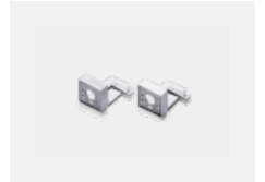
00-20700, W 2 pcs of wall fastening Lipo/Lina