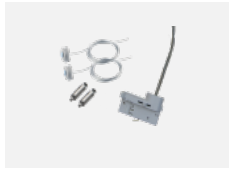
00-51300, W set for suspension into 3-phase track, non- dimmable luminaires