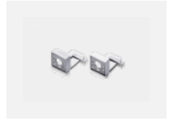
00-20700, W 2 pcs of wall fastening Lipo/Lina