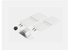
00-20101, W 2xend cap - metal, 5- conductor terminal box, grommet; Lipo80/Lina80