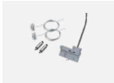
00-51300, W set for suspension into 3-phase track, non- dimmable luminaires