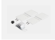
00-20101, W 2xend cap - metal, 5- conductor terminal box, grommet; Lipo80/Lina80