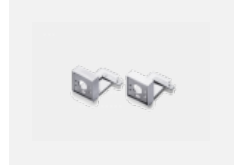
00-20700, W 2 pcs of wall fastening Lipo/Lina