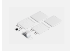
00-20103, S 2xend cap - plastic, 5- conductor terminal box, grommet; Lipo80/Lina80