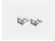
00-20700, S 2 pcs of wall fastening Lipo/Lina