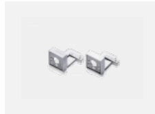
00-20700, W 2 pcs of wall fastening Lipo/Lina