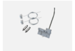
00-51300, W set for suspension into 3-phase track, non- dimmable luminaires