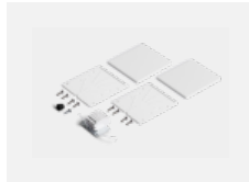
00-20103, W 2xend cap - plastic, 5- conductor terminal box, grommet; Lipo80/Lina80