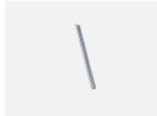
00-00364, K cable 5x1,5 4000mm