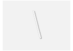
00-00355, W cable 5x0,75 2000mm, white