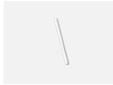
00-00352, W cable 3x0,75 2000mm, white