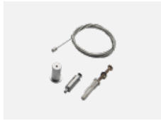
00-00300, N wire suspension 2000mm