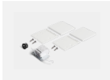
00-20101, W 2xend cap - metal, 5- conductor terminal box, grommet; Lipo80/Lina80