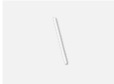
00-00360, W cable 3x0,75 6000mm, white