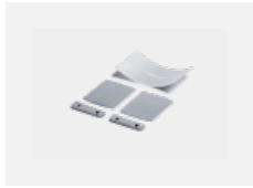
00-00200, N straight connector