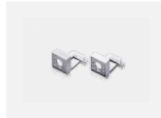
00-20700, W 2 pcs of wall fastening Lipo/Lina