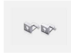
00-20700, S 2 pcs of wall fastening Lipo/Lina