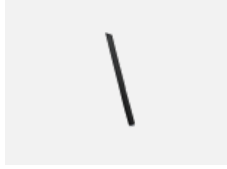
00-00358, B cable 3x0,75 4000mm, black