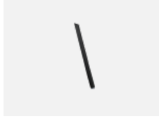
00-00360, B cable 3x0,75 6000mm, black