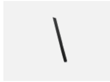
00-00352, B cable 3x0,75 2000mm, black