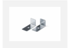
00-01200, F Accessory for gear-tray release