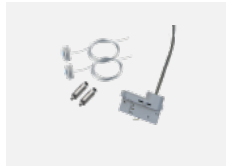
00-51300, W set for suspension into 3-phase track, non- dimmmable luminaires