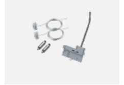
00-51300, W set for suspension into 3-phase track, non- dimmable luminaires