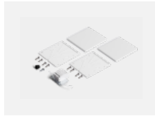
00-20103, B 2xend cap - plastic, 5- conductor terminal box, grommet; Lipo80/Lina80