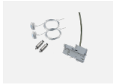
00-51301, W set for suspension into 3-phase track, dimmable luminaires