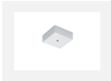
00-00370, S ceiling cup 80x80x32mm