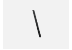
00-00355, B cable 5x0,75 2000mm, black