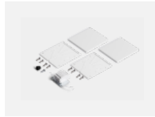
00-20103, B 2xend cap - plastic, 5- conductor terminal box, grommet; Lipo80/Lina80