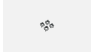
19-0009, W Mounting distance kit for square luminaire, circular 370 mm