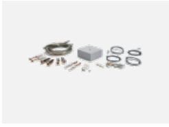
00-00333, B suspension set 2000mm, 4 pcs.of wires, cable 5x0,75mm, ceiling cup