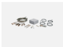
00-00333, W suspension set 2000mm, 4 pcs.of wires, cable 5x0,75mm, ceiling cup