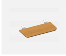
109-0004, WD shelf