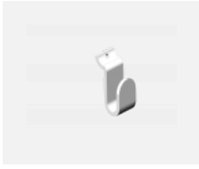
109-0003, W hook