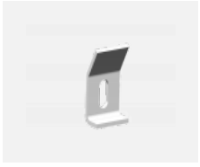
109-0001, F wall fastening