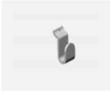
109-0003, S hook