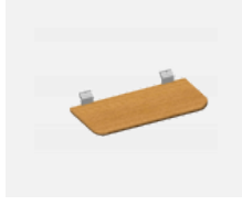
109-0004, SD shelf