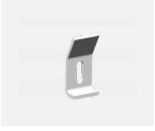
109-0001, F wall fastening