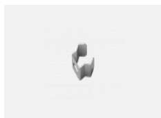
108-0002, F wall fastening for 108-301K