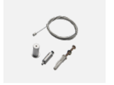
01-0007, N wire suspension 2000mm