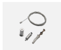
01-0007, N wire suspension 2000mm