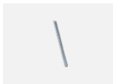
00-00352, K cable 3x0,75 2000mm, transparent