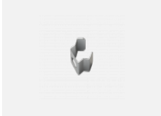
108-0002, F wall fastening for 108-301K