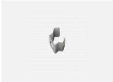
108-0002, F wall fastening for 108-301K