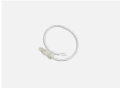
101-0016, W cable 5x 0,75 mm, 6m with WAGO connector, white