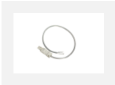
101-0013, S transparent cable 3x 0,75 mm, 2m with WAGO connector