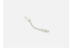
101-0012 cable 5x 0,75 mm with WAGO connector