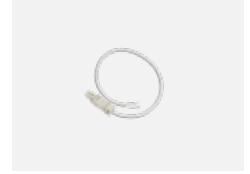
101-0013, W cable 3x 0,75 mm, 2m with WAGO connector, white