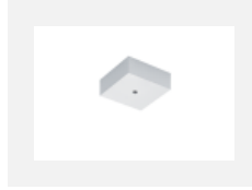
00-00370, W ceiling cup 80x80x32mm