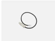
101-0015, B cable 3x 0,75 mm, 6m with WAGO connector, black