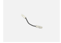
101-0011, B cable 3x0,75mm with WAGO connector, black