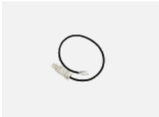
101-0013, B cable 3x 0,75 mm, 2m with WAGO connector, black