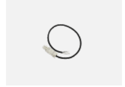
101-0013, B cable 3x 0,75 mm, 2m with WAGO connector, black