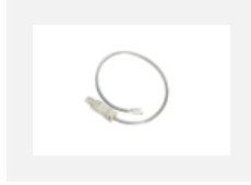
101-0016, B transparent cable 5x 0,75 mm, 6m with WAGO connector