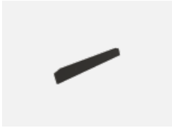
100-0001, B end cap - metal