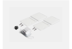
00-20101, W 2xend cap - metal, 5- conductor terminal box, grommet; Lipo80/Lina80