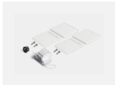
00-20101, W 2xend cap - metal, 5- conductor terminal box, grommet; Lipo80/Lina80