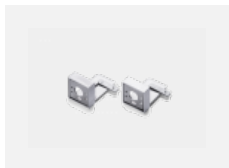
00-20700, W 2 pcs of wall fastening Lipo/Lina