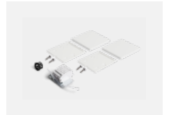
00-20101, W 2xend cap - metal, 5- conductor terminal box, grommet; Lipo80/Lina80