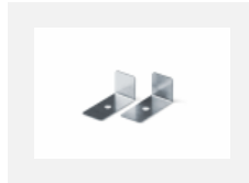
00-01200, F Accessory for gear-tray release